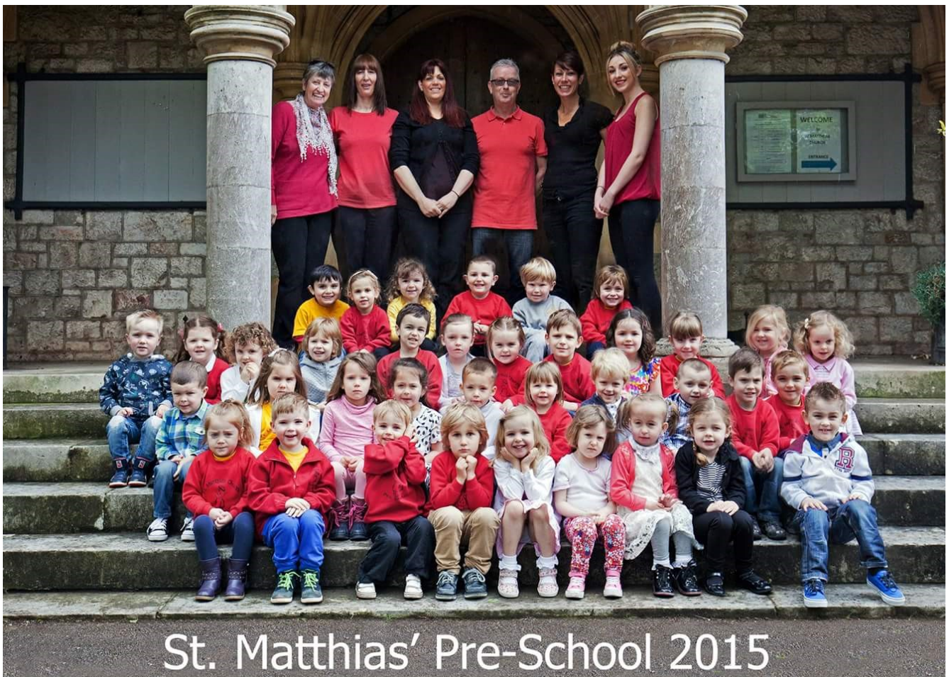
St. Matthias' Pre-School 2015

Later on this term we will be thinking about Harvest and having a celebration.